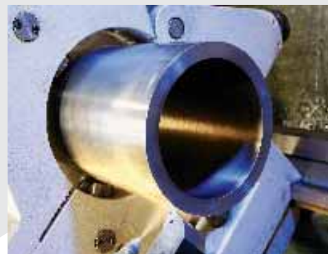
Cylindrical target manufacturing capabilities