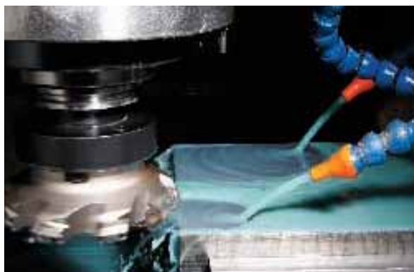
Planar target manufacturing capabilities