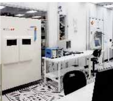
Applications lab for product and process development